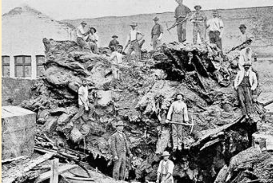
The Gum diggers

1920's early depression and a bit before there were gum diggers working Algies Bay & Snells Beach.