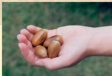
Oak Tree Acorns