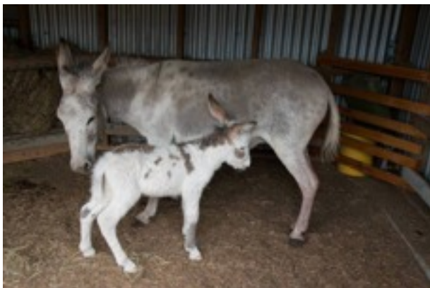
Topsy and her foal, Turvy.